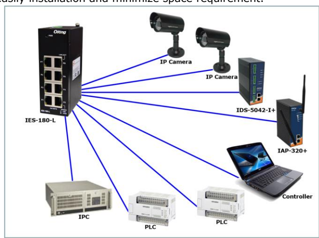
Connections of Ethernet devices

IES-180-L can be used in connecting several Ethernet devices like Ethernet I/O, IP-Camera or other Ethernet switches. In addition, its mini size enables easily installation and minimize space requirement.